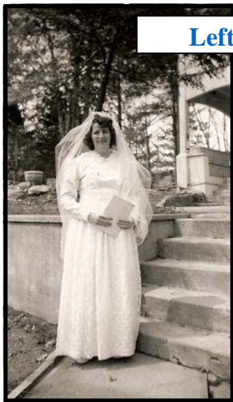
Left: On her "Clothing Day"– April 30, 1956

Treasury Department, on her resignation to enter the Order of the Franciscan Sisters of the Atonement at Greymoor, Garrison, New York.